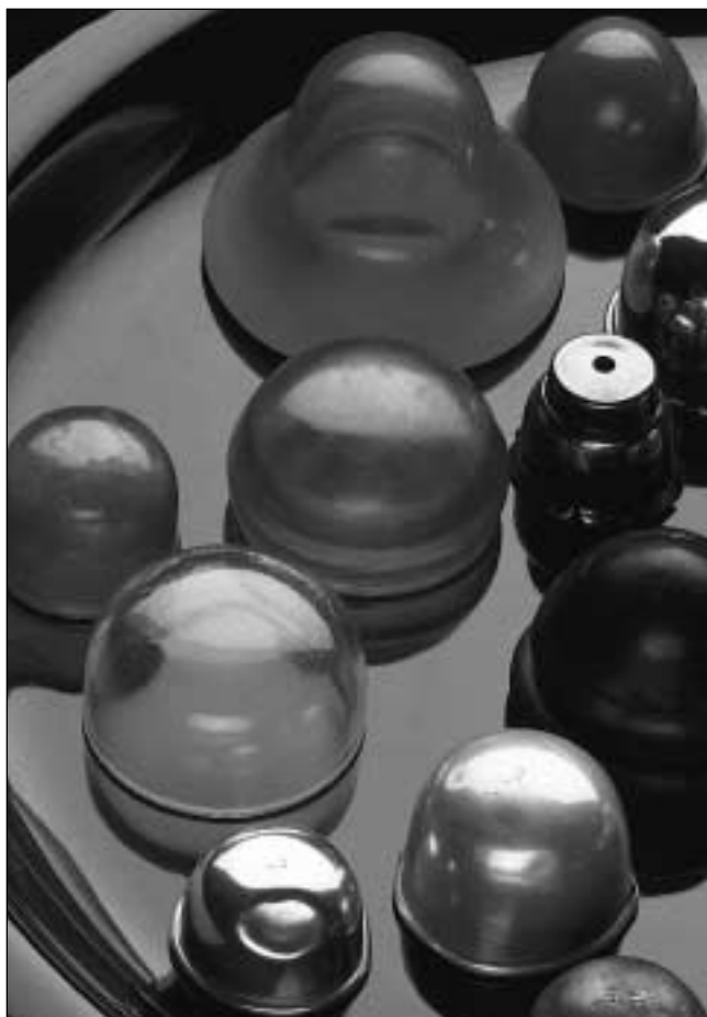
Figure 3b. Cervical caps