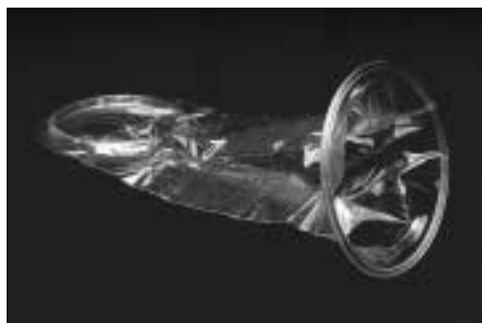
Figure 1. The Female Condom

Problems are uncommon with the use of the female condom. Slippage has been cited as a problem specific to the use of the female condom. 7