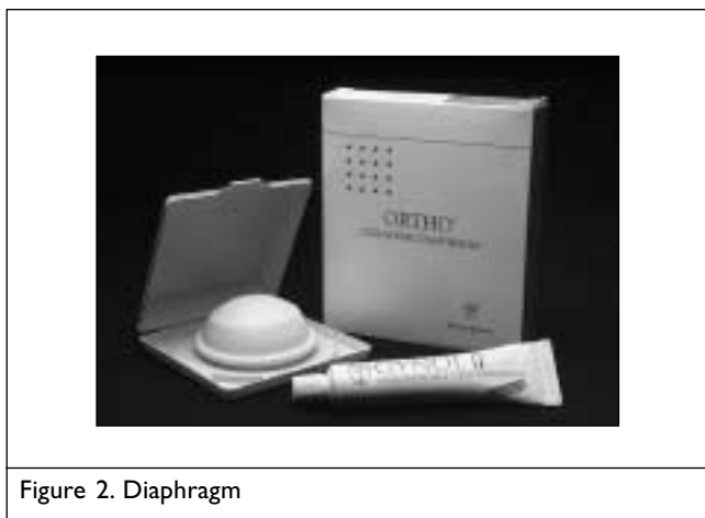
Figure 2. Diaphragm

Before a woman can successfully use the diaphragm or cervical cap, she will require detailed instructions for insertion, the opportunity to practise, and reassurance from the clinician. Reinforcement of the correct procedures is valuable, as are tips to becoming more comfortable with one's body. Providing information about the menstrual cycle will help women use their barrier method more effectively. Providing information