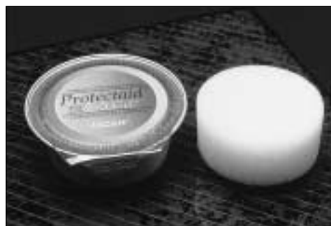
Figure 4. Contraceptive Sponge

The sponge may best meet the needs of women who wish to or must avoid hormonal contraception. 3 Some women choose the sponge because of its prolonged 12 hours of protection. It is less messy than spermicide used alone or with a